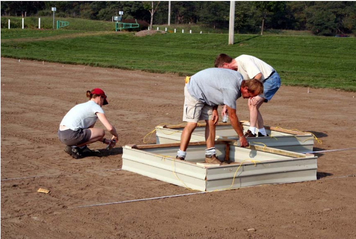
Figure 1. Hand seeding 1.5m x 1.5m plots of Kentucky bluegrass.

September 12, 2005 at a rate of 11.1 g m -2 into 1.5 x 1.5 m plots in a randomized complete block design on a sandy loam soil plot area at the Guelph Research Station (Figure 1). Plots were rated for germination and cover establishment during fall 2005 (Tables 1 - 3, following). Germination was rated visually on a scale of 0-10 on two dates, 10 and 15 days after seeding, and was estimated by using on Spectrum CM1000 chlorophyll meter on 4 dates, 10, 16, 21, and 24 days after seeding (Table 2, Figure 2). There were significant differences observed among the cultivars in speed of germination and cover development, and a significant correlation between visual germination estimates and cover development estimated by chlorophyll index (Figure 3).